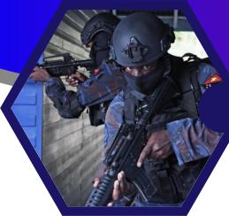
Special Service Division