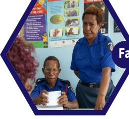
Family and Sexual Violence Unit