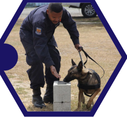
K-9 - Dog Unit